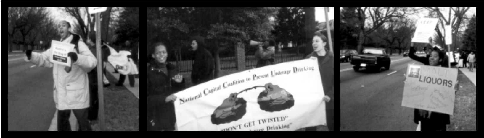
NCCPUD Youth Advocates Demonstrate Outside of NBC Studios in Washington D.C.

At the promised follow-up meeting, both groups began discussing the ads that were on the airwaves. One ad was for “Bacardi Silver,” an alcopop appealing to many underage youth. The ad aired at 9:15 p.m. and NCCPUD’s Director’s 11-year-old son was still up and watching television. A lengthy discussion ensued about treatment of the alcopops; how they should be viewed in advertisements, and what they are made of (they are not liquor, beer, wine, or a wine cooler). ●